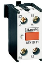
Auxiliary contact BFX10